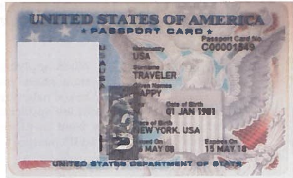
PASSPORT CARD: Valid when entering the United States from Canada, Mexico, the Caribbean and Bermuda at land border crossings or sea ports-of-entry. Not valid for international travel by air.